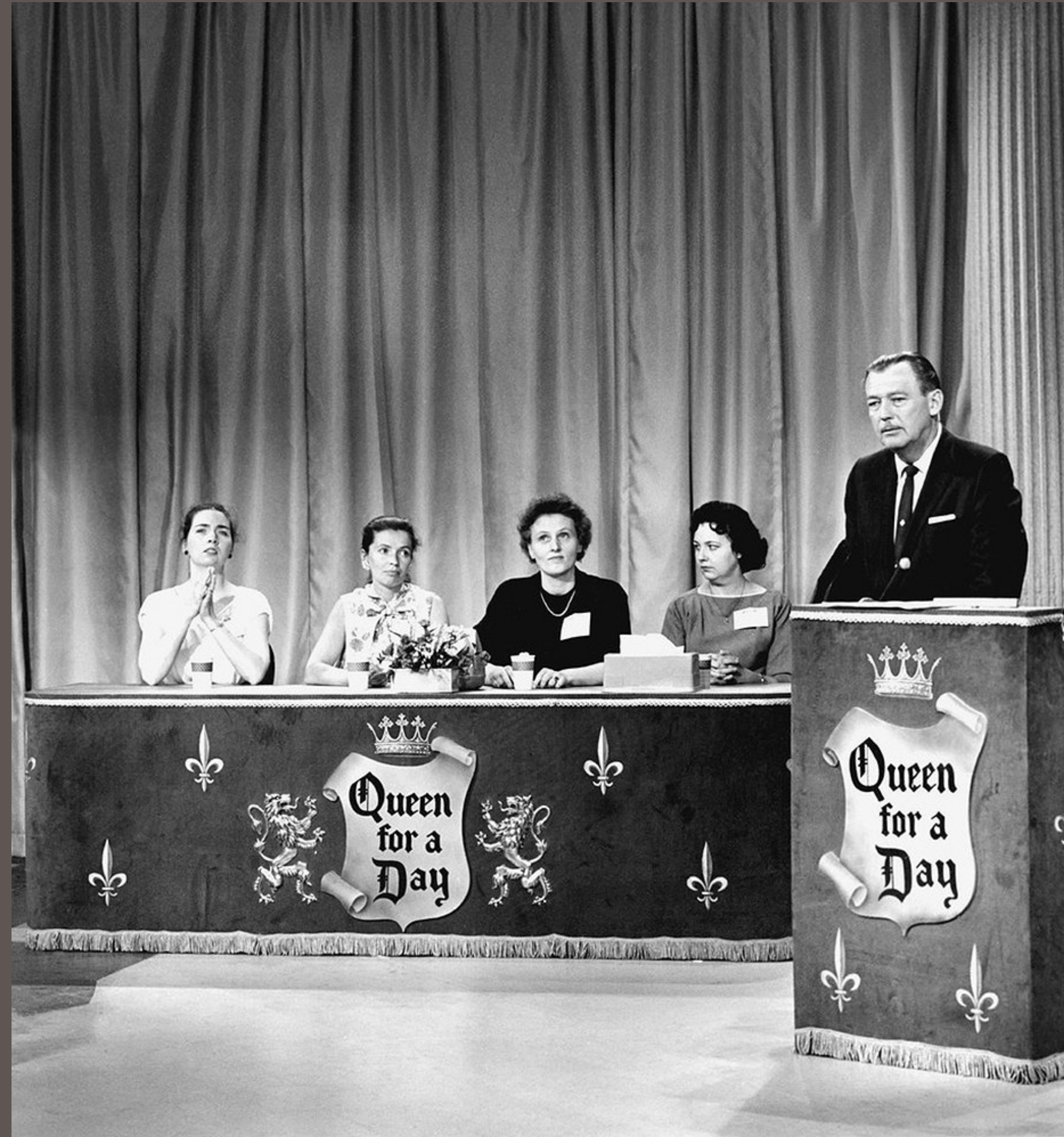
QUEEN FOR A DAY TV-PROGRAM ON NBC 1965

I suspect that the relational aesthetics method has thrown out the baby with the bathwater. Though a lot of brutality and cruelty is unproductive, upheld and propelled by nothing but stupidity. The aim of eliminating it makes sense. But not all that appears brutal or cruel also truly is. One might even regard the compassion conjured up as counterproductive and belittling. In REAL CRUEL I intend to explore if there are still facts of cruelty that are worth dissecting and presenting. That might bring out other ways of seeing that up until recently have been buried by the relational aesthetics wave. I suspect there is plenty to discover behind the paywall of uncomfortability and cruelty.